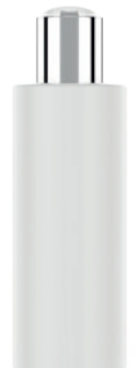
BOTTLE 200 ML DISC TOP